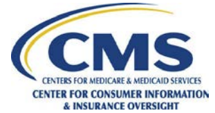
Table of Contents for Blueprint for Approval of State-Based Health Insurance Exchanges